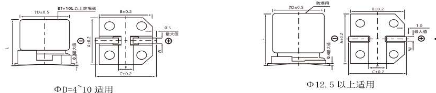
Diagram of Dimensions 尺寸图